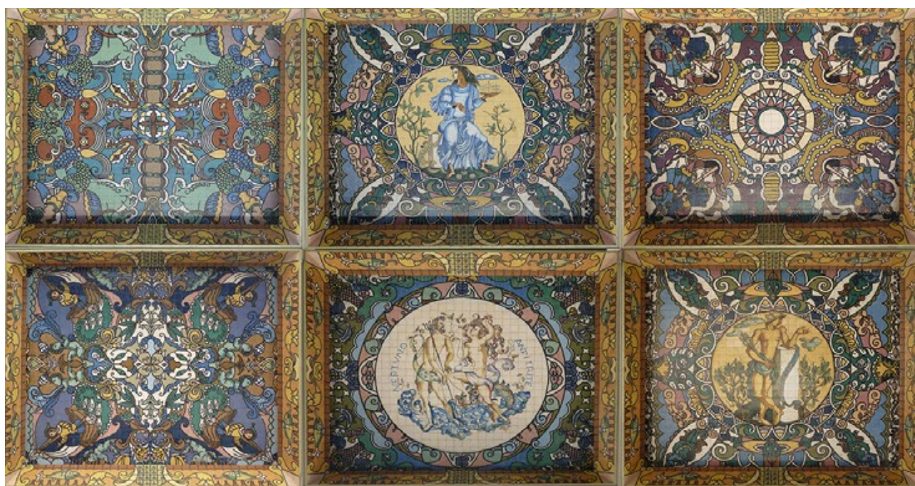
Fig.2 · Atlântico Palace, Oporto, 1950. Jorge Barradas, The six different themes

His awareness of the history of Portuguese ceramics is plainly visible in the work's conception, and the link between the ceramic tradition and Modern architecture is no less evocative of the coffered ceilings from the 17 th and 18 th centuries, whose painted compositions were also enclosed by frames.