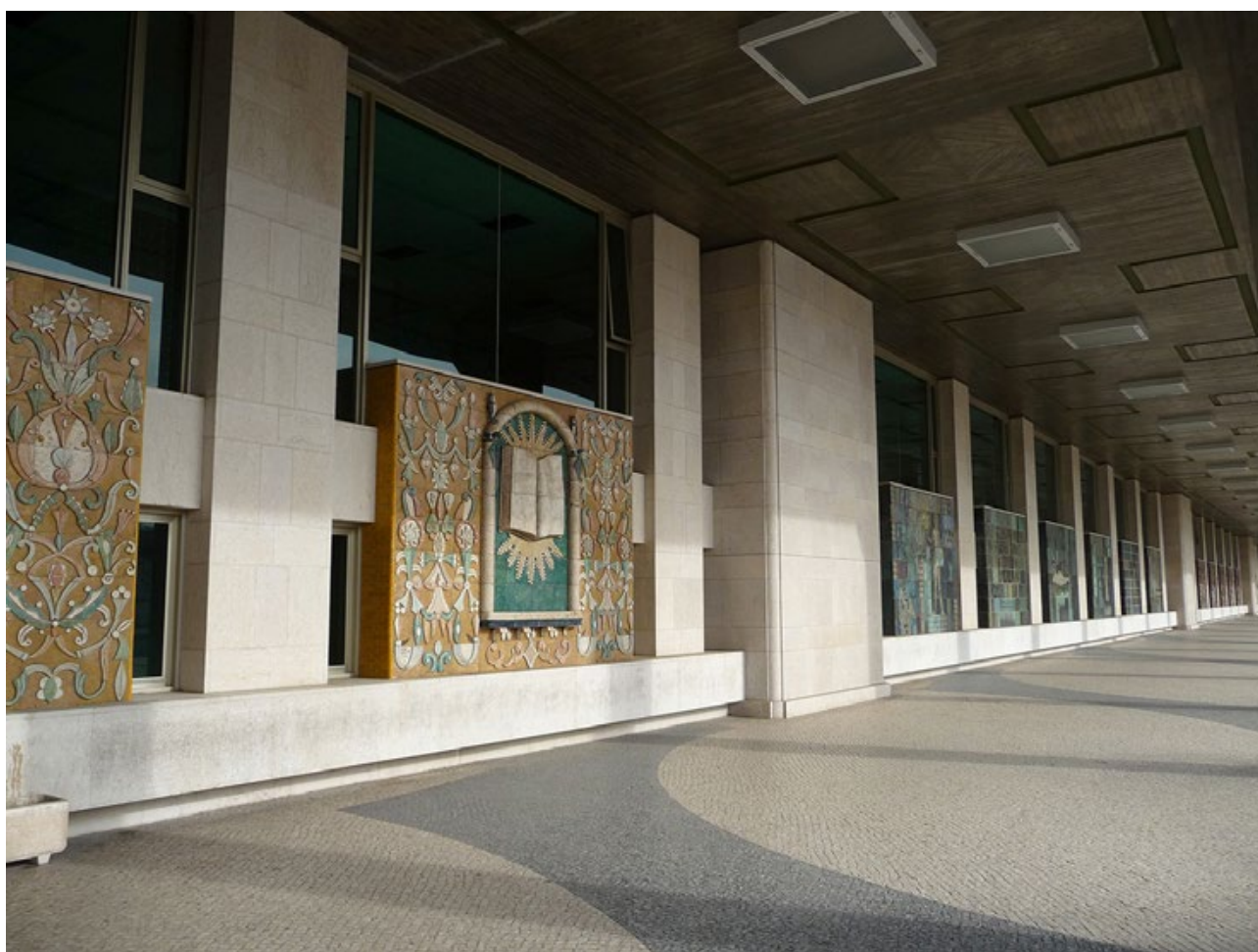
Fig.7 · Palace of Justice, Lisbon, 1969. Jorge Barradas, The interior of the porticoed gallery

Here, then, the artist's intervention is different from the two previous case studies. His work is located in the building's external gallery, in a space that is similar to the one in the Atlântico Palace. The same gallery also contains works by Júlio Resende (1917-2011) and Querubim Lapa – two artists whose oeuvres, due to their quality and importance, represent two landmarks in the ceramic output from this period [fig.7].