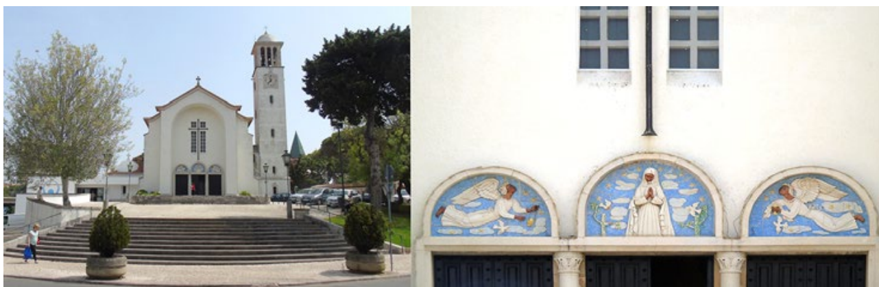
Fig.4 · Parish Church of Nossa Senhora de Fátima, Parede, Cascais, 1953