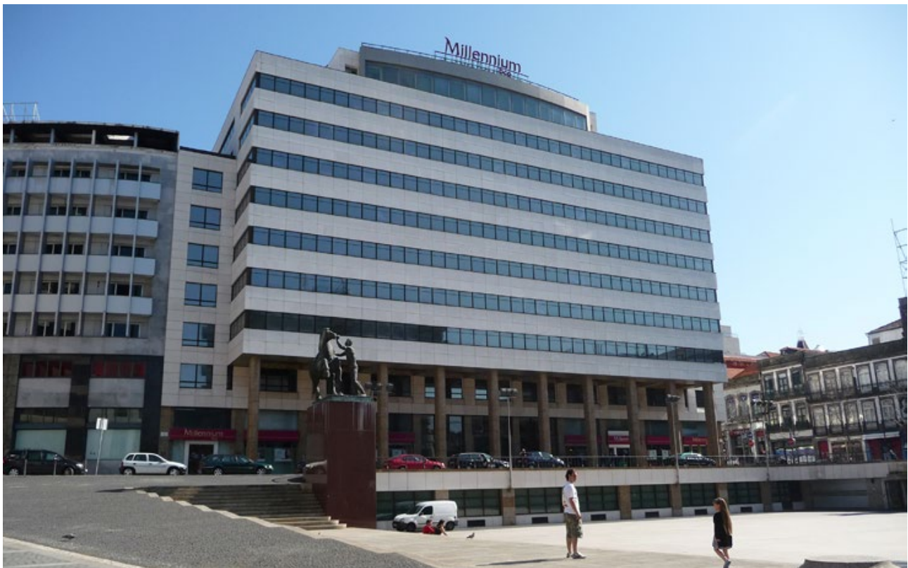
Fig.1 · Atlântico Palace, Oporto, 1950

In the embossed panel positioned at the interior, the frames are evoked by a pair of classical pilasters enclosing the central figure of Neptune, whilst the outside decorations resort to traditional two azulejos frames, delimiting each coffer and integrating it within the architecture. The sequence of nine coffers depicts six different themes, namely (from left to right): 1) mermaids, 2) an Allegory of Navigation, 3) navigators, 4) fishermen, 5) Neptune and Amphitrite, 6) fishermen, 7) navigators, 8) an Allegory of Trade, 9) mermaids. The decorations follow two symmetrical, albeit different compositional schemes, one of them organised according to a central axis and the other displaying a central cartouche. The ensemble begins and ends with the mermaid motif, whereas