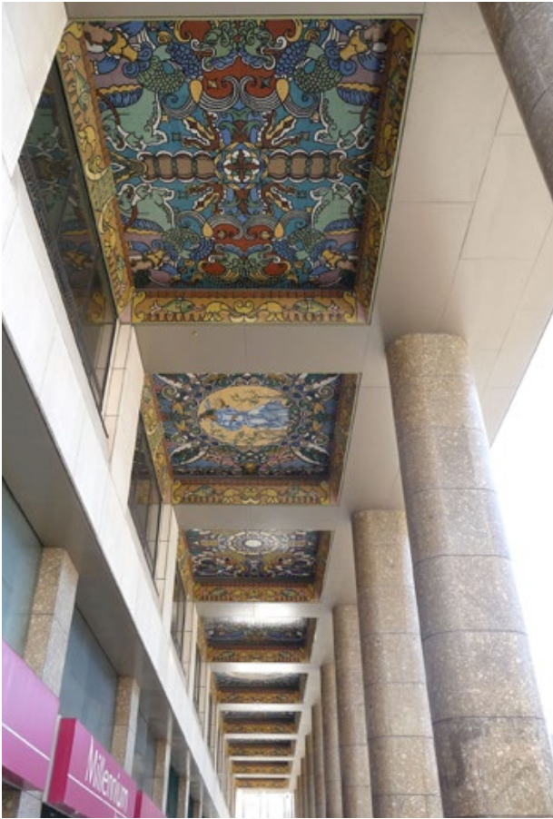
Fig.3 · Atlântico Palace, Oporto, 1950. Jorge Barradas, The interior of the porticoed gallery