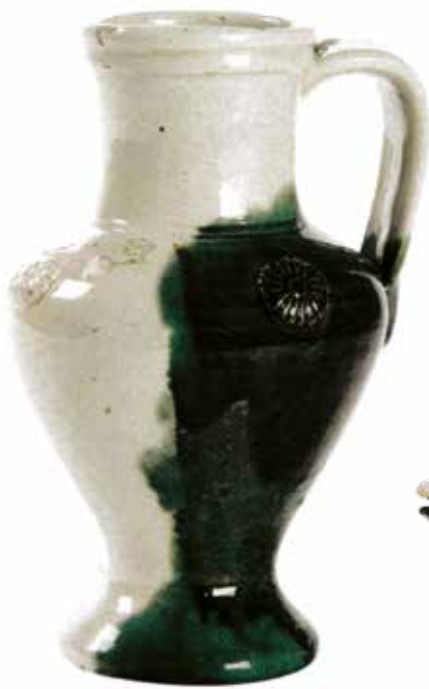
Fig. 14· Pitcher, attributed to Manuel Mafra, 19 th century; faience.