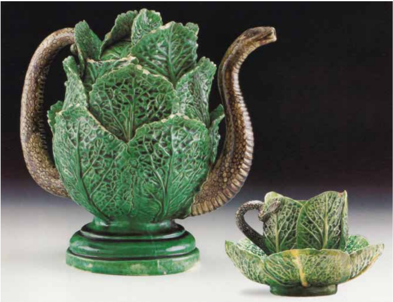
Fig. 18- Teapot and Cup in the Shape of Cabbage Leaves, faience, Augusto Baptista de Carvalho, late 19 th century.

Animal motifs appear as well: monkeys adorned with flowers, or dogs carrying baskets. Though popular in style, these works reveal the influence of erudite traditions. One striking example is a pair of candlesticks in the form of crowned lions, naively modelled yet evoking both heraldic rampant lions and the Chinese iconography of dogs of Fo (Henriques, 2004: 203).