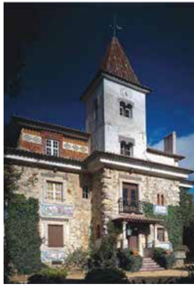
Fig. 09- Palacete Visconde de Sacavém.