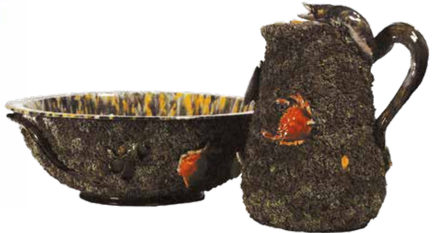
Fig. 15· Basin and Jug, Caldas da Rainha Earthenware Factory, 1888; faience.