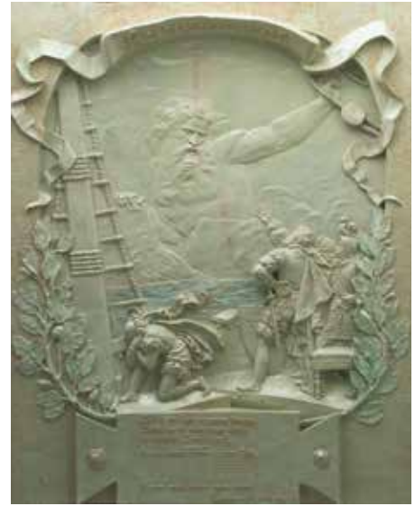
Fig. 10- Adamastor, 1897 (with signature) and 1898 (with mark on reverse); bas-relief, faience; Inv. MC 5; Museum of Ceramics, Caldas da Rainha, Museums and Monuments of Portugal, E.P.E / Photographic Documentation Archive (Photographer: José Pessoa).

The collection features unique works that, in addition to being signed and dated, also bear Bordalo Pinheiro's distinctive manufacturing marks most notably The Adamastor , a bas-relief inspired by the episode in The Lusíads [fig. 10].