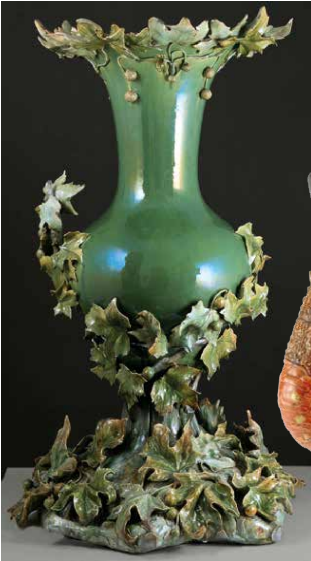
Fig. 11. Plane jar, Rafael Bordalo Pinheiro, FFCR, 1901; faïence; Inv. MC 79; Museum of Ceramics, Caldas da Rainha, Museums and Monuments of Portugal, E.P.E / Photographic Documentation Archive (Photographer: José Pessoa).