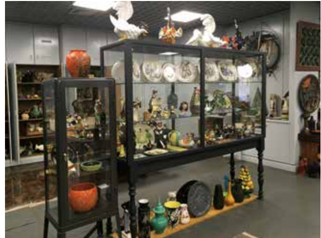
Fig. 05. Detail of pieces from the Caldas da Rainha Earthenware Factory (Fábrica de Faianças das Caldas da Rainha).