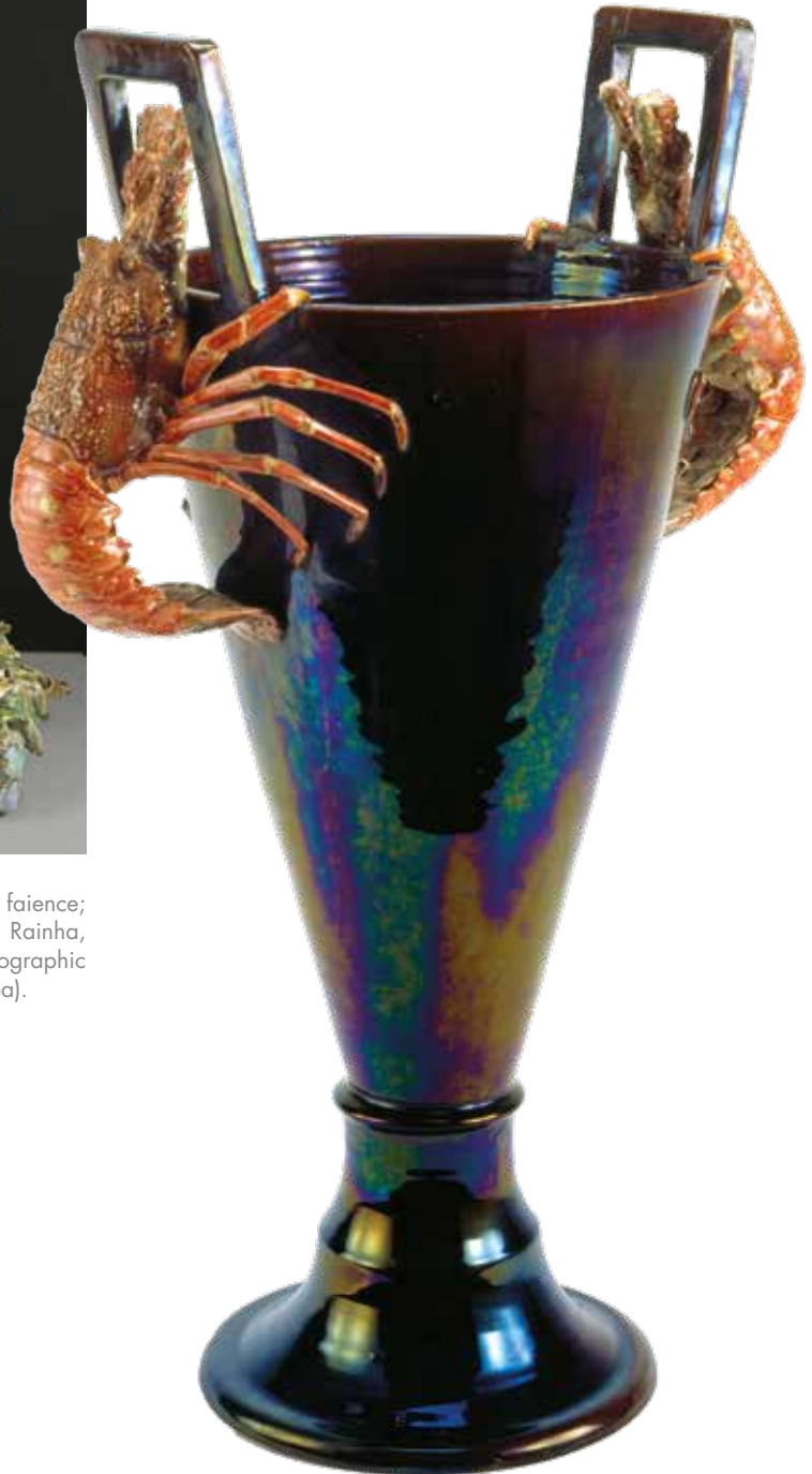
Fig. 12. Large Vase with Lobsters, Rafael Bordalo Pinheiro, FFCR, 1904; Inv. MC 81; Museum of Ceramics, Caldas da Rainha, Museums and Monuments of Portugal, E.P.E.