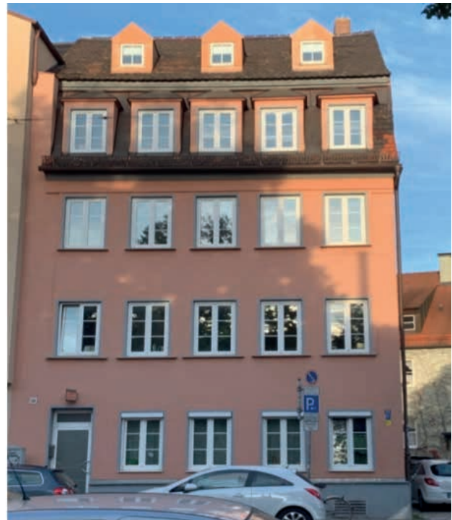
Fig. 04. A 2019 photograph of the present-day Nebenschneidhaus located near the horse market

From December 1583 the big Schneidhaus and the smaller Nebenschneidhaus were run in a building combination near the Roßmarckt (horse market). Unfortunately, today only size and structure of the smaller building can be seen.