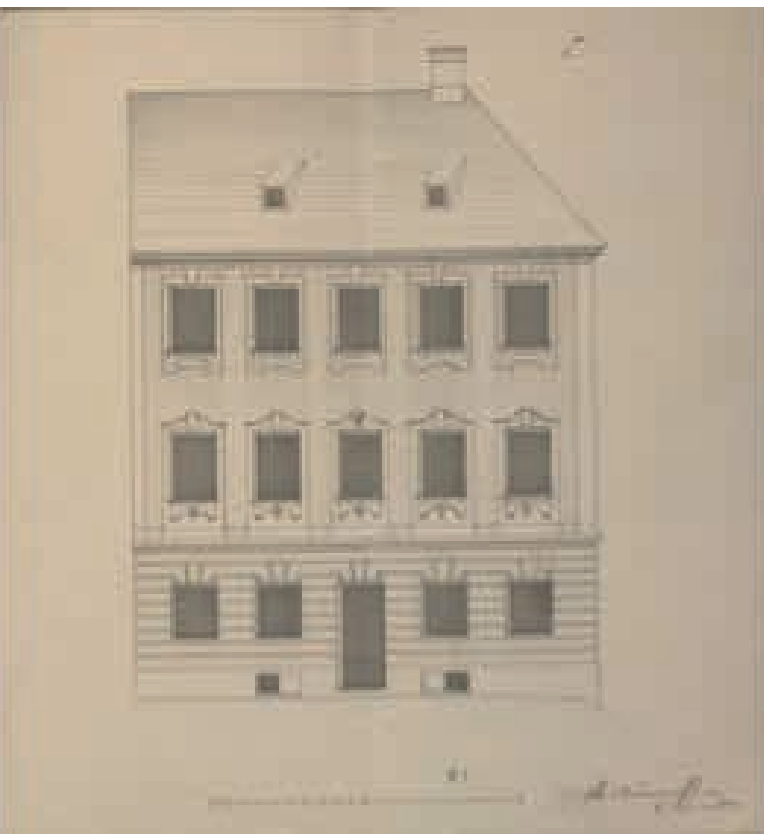
Fig. 06. Rough sketch of the façade of a new hospital on goose hill by the master mason Benterieder, ca. 1571

A manuscript belonging to the context of the Schneidhaus , underlines this conclusion and opens new perspectives, at the same time 41 .