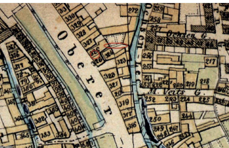
Fig. 05. Location of the large and small Schneidhaus with a garden in Augsburg, Wengplan 1874, annotations made by A. Kinzelbach.

ranged in an L-formation. In image four is visible how the small Nebenschneidhaus – situated exactly in the same neighborhood of other buildings as its earlier version – adjoined at the one side open space and at the backside was separated by a clearance from a neighboring building. How tiny distances were separating neighbors in early modern Augsburg can be seen in image five, in which the Fuggers' property between the street and the river Lech is marked red – two houses joined at street-level, a garden, shared courts