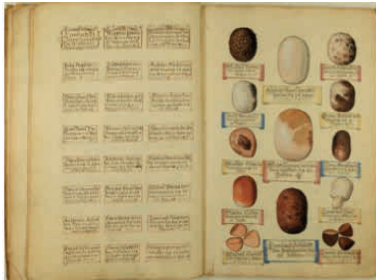
Fig. 07. Illustrated Manuscript representing records of surgery and bladder stones, MS 112, © Deutsches Medizinhistorisches Museum Ingolstadt.

The anonymous manuscript in the museum in Ingolstadt displays 20 similar double-pages with adorned records of cures of hernia on the left and disembodied bladder stones on the right side. All-in-all it represents an elaborate, though odd account of surgery on 704 different patients because many details but no dates are given, one singular exception is dated December 1617. Comparison with account-books from the Fugger archive revealed that all cures were performed in the Schneidhaus of the Fugger during the first decades of the seventeenth century 42 . Though neither author nor initiator of the manuscript are known, this manuscript could fit perfectly into the developed arguments: The opposite folios could be seen rather simplistically as a form of representation for success in the running of an innovative hospital. The purpose of treatment was to release cured patients and only few red crosses signaled total medical defeat because of the death of patients. Documenting a specifically successful hospital for the public might have enhanced the prestige of Marx Fugger (1564-1614) in a time of increasing confessional and social tensions shortly before and during the first decade of the Thirty Years' War 43 .