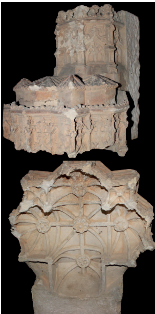
Fig. 05. Master Huguet, Monastery of Batalha workshop, Canopy, side and bottom view, ca. 1402–1426, limestone, 53 x 49 x 54 cm, Monastery of Batalha—Deposit (Inv. N.º 145 A) © MB/DGPC.