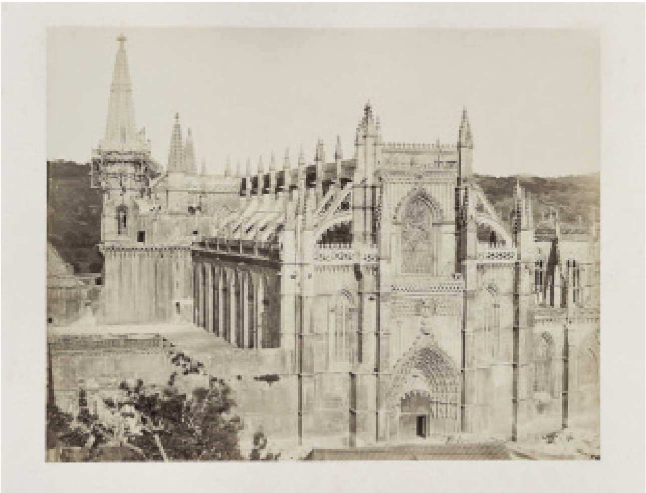
Fig. 02. Vigé & Plessix Photographers, Monastery of Batalha, general view, ca. 1860, paper & albumin, 31,5x 40,5 cm, Ajuda Library, Lisbon (46925 DIG) © DGPC/ADF.