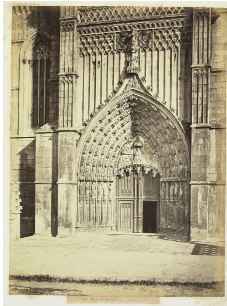
Fig. 03. Charles Thompson Photographer, Monastery of Batalha, the western doorway of the church, in The Sculptured ornament of the Monastery of Batalha in Portugal 1868, p. 19, (purl.pt/18571) © BNP.

Around 1873, the churchyard facing the main church portal was demolished, a consequence of the removal of soil accumulated over the centuries near the base of the building. Photographs taken by Charles Thompson (1816–1868) and published in London in 1868 testify to this moment ( The Sculptured Ornament... , 1868: 17, 19). (Fig. 03) The portal deserved particular attention during the restoration works for its composition and sculptural quality. It was the most elaborate medieval portal in Portugal. Instead of a usual gable, the great door of the Batalha church has an ogee, which allows for the existence of a double tympanum over the archivolts. The high arches, branching along the wall, rest on the base band, decorated by diamonds with four-lobes inwards. On this base band, on both sides, there are fourteen bases of slender columns whose intervals are carved shapes that appear to represent miniature blind crevices with a central mullion. Upon these, twelve corbels decorated with various phytomorphic, zoomorphic and heraldic motifs support the bases on which the Apostles' statues are set. Each Apostle is framed by an elaborate canopy on top.