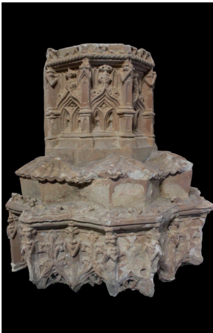
Fig. 06. Master Huguet, Monastery of Batalha workshop, Canopy, ca. 1402–1426, limestone, 54 x 46,5 x 53 cm, Monastery of Batalha—Deposit (Inv. N.º 143 A) © MB/DGPC.

The historical and artistic value of all these original 15th-century elements is unquestionable, and it is fundamental to determine their temporal and stylistic context. We now know that the design of the main portal in Batalha was largely due to the monastery's second master-builder during the first quarter of the 15th century (Guillouët, 2011: 74). However, since we can find similarities and affinities with several counterparts in neighboring Spain, there is not one exact model.