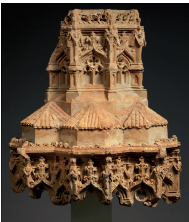
Fig. 01. Master Huguet, Monastery of Batalha (Portugal) workshop, Canopy, ca. 1402–1426, limestone, 20 7/8 × 19 1/2 × 13 3/4 in., 120 lb. (53 × 49.5 × 34.9 cm, 54.4 kg), The Metropolitan Museum of Art—The Cloisters Collection (2016.246).

The MET Cloisters recently acquired a peculiar architectural canopy that belonged to the main portal of the medieval monastery of Santa Maria da Vitória in the Portuguese village of Batalha 1 . (Fig. 01). This piece, now in New York, surmounted one of the twelve statues of the Apostles. In the 19th century, the portal was altered from its initial dimension and many of its original sculptural elements were replaced by copies. These transformations occurred during major restoration works due to the historical significance of the building and in a specific moment of national identity affirmation.