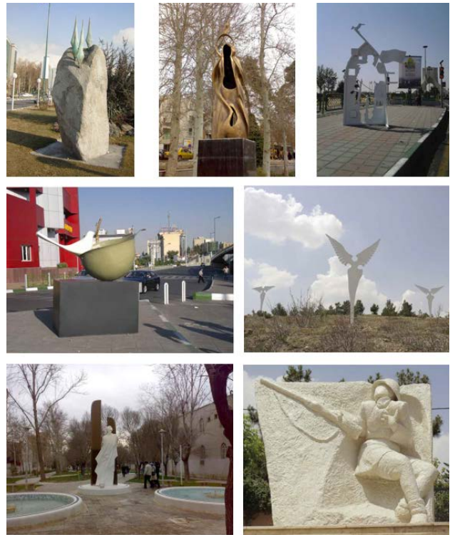
Fig. 07- Figurative Statue using symbolic elements such as cypress, pigeon, flight.