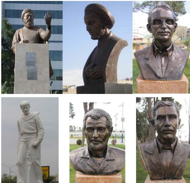
Fig. 06- Statues and busts of the martyrs of the revolution and war in the different parts of Tehran like Velayat Park, streets, highways and squares.