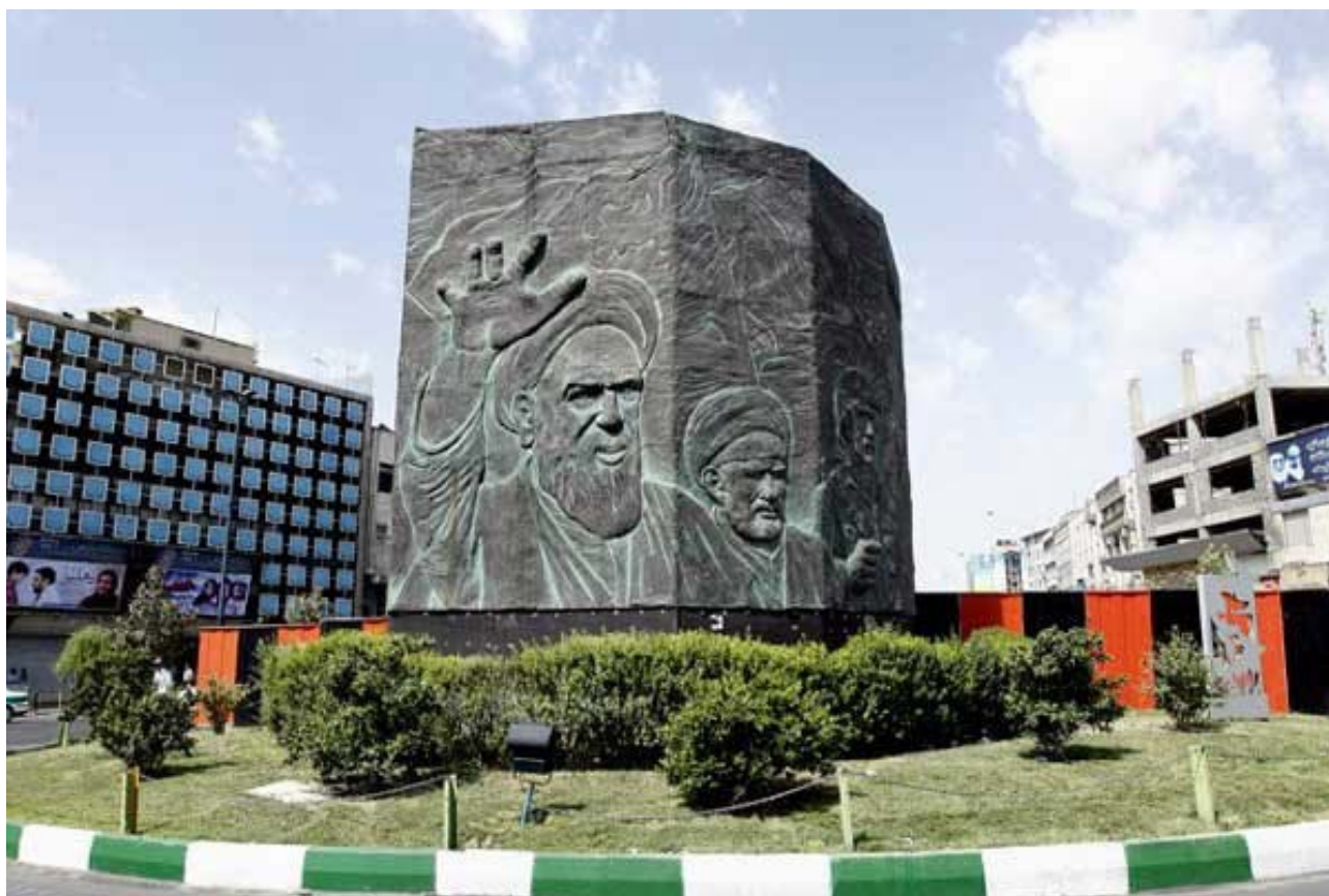
Fig. 04. A statue in the Revolution Square, as a round relief depicting the role of different groups of people.

(Eskandari, 2016). During the war, not only realistic and figurative statues were considered as a symbol of the previous regime, but also the sculptors were faced with the Islamic ban on making life-like statues; hence, symbolic revolutionary elements such as tulips, birds, and pigeons were used. The statues representing symbolic revolutionary elements were installed in city squares. In this period, the sculpture that remained from the former regime, but did not promote the Pahlavi doctrine, were reinterpreted in the light of Islamic and revolutionary concepts. For instance, the Bagh Shah Square in which the sculptures of Garshasb and a dragon were built to commemorate Azerbaijan's freedom was renamed to Horr Square 2 . To many of the viewers, the sculptures are reminiscent of Karbala — where the Ashura event took place.