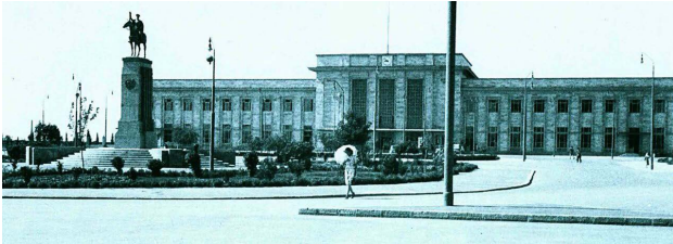
Fig. 02- Sculpture of Reza Shah in the Rah Ahan Square in the south of Tehran.